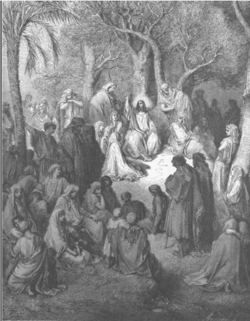
Illustration: The Sermon on the Mount

PRAYER. – every day, every curse and every punishment is far removed from us, and blissfully and peacefully do we rest in the bosom of God and await eternal life, which He will surely give us. "Bless the Lord, O my soul, and forget not all His benefits: who forgiveth all thine iniquities." This is most certainly true. Amen.